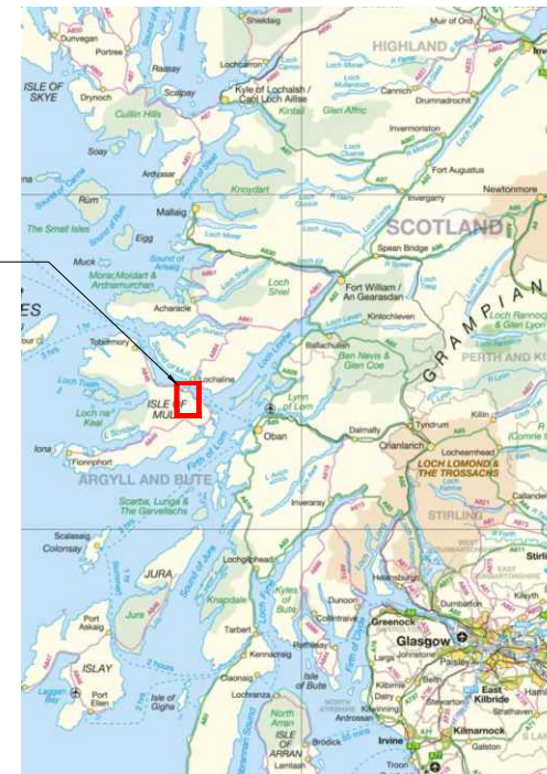
SCHEME LOCATION MAP 1:2,500,000